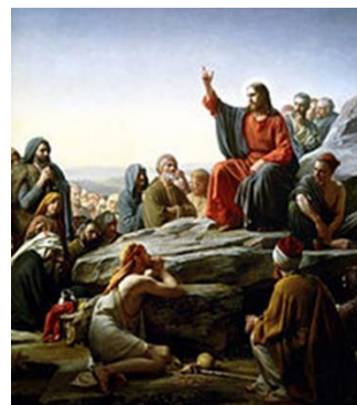
The Sermon on the Mount by Carl Heinrich Bloch

An exposition of Jesus' Sermon on the Mount in Matthew 5-7. The emphasis is upon the distinctive character that is expected of the Christian. This is designed to be a penetrating study for "would-be" disciples of Jesus.